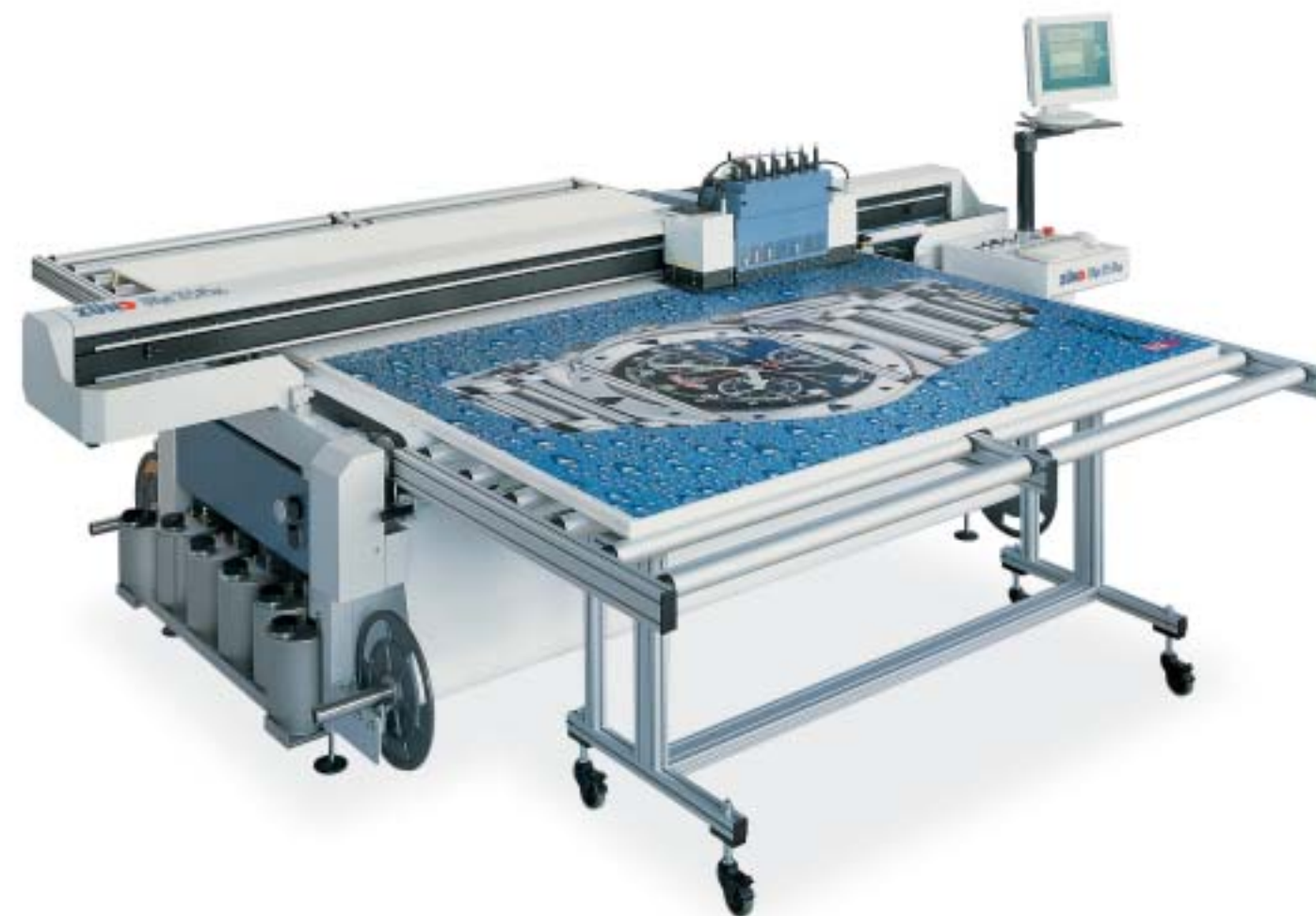
UVjet 215-Plus 09/04 3000 en rva